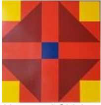
Hens and Chicks